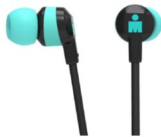
SE-IM5BT-GR (Mint) UPC: 814633021444