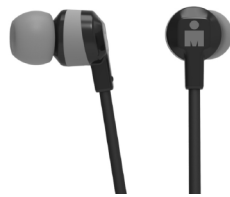
SE-IM5BT-H (Gray) UPC: 814633021420