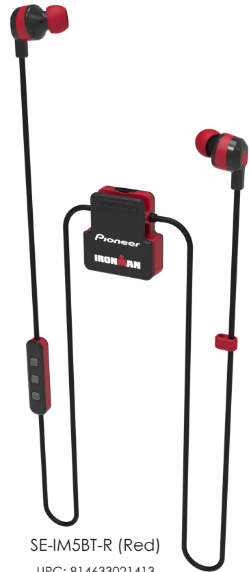
SE-IM5BT-R (Red) UPC: 814633021413