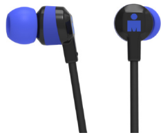
SE-IM5BT-L (Blue) UPC: 814633021451