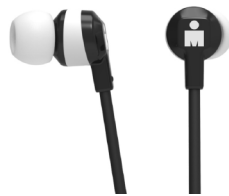
SE-IM5BT-W (White) UPC: 814633021437