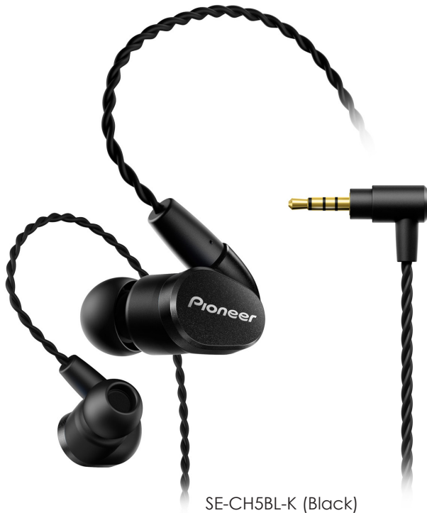
SE-CH5BL-K (Black) UPC: 814633020737

Take a sonic leap forward with the SE-CH5BL, high-performance headphones featuring a 2.5 mm (2/16") stereo connector for Balanced Audio Output.