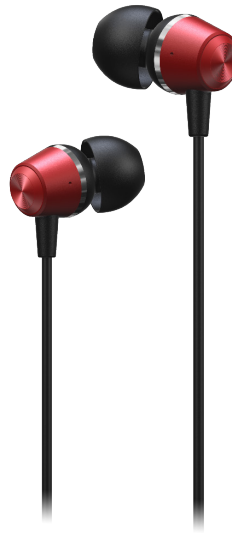
SE-QL2T-R (Red) UPC: 814633021871