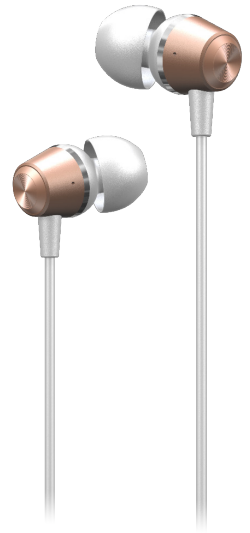
SE-QL2T-P (Pink) UPC: 814633021895