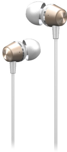
SE-QL2T-G (Gold) UPC: 814633021888