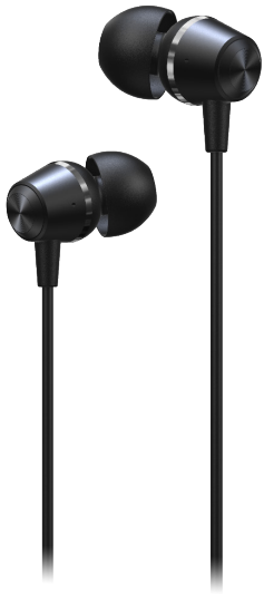
SE-QL2T-B (Black) UPC: 814633021864